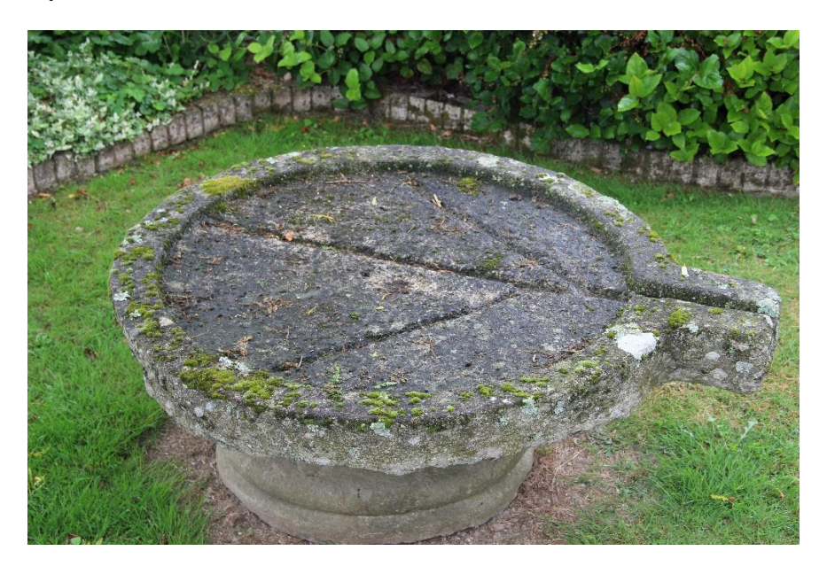
Steam trough of the presbytery.

A "laundry sheet" covers the whole vat in which the various elements to be washed are laid out in successive layers, taking care to place the less soiled pieces at the bottom. After a first layer of cloths, sheets, shirts... we would sprinkle it with wood ash, "ludu tan". Those ashes were full of potash and were sprayed with hot water; then a new layer of laundry was placed. And so on up to the limit allowed by the vat. All that remained was to fold down the whole, the edges of the "laundry sheet" and to pack with a heavy stone.